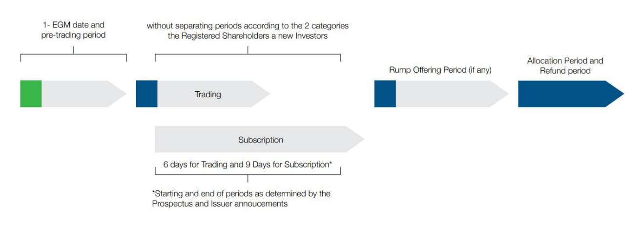
Figure No. (2): Trading and subscribing mechanism for traded Rights.

The company has applied to the Capital Market Authority to register and offer new shares. The company has also applied to the Saudi Stock Exchange (Tadawul) to accept its listing.