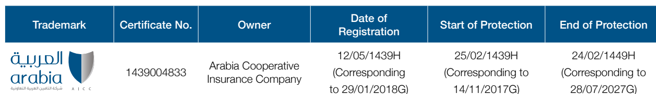
Table No. (78): Trademark

In marketing its services and products, the Company relies on its commercial name registered in the commercial registration, which is reflected in its logo, and supports its business, its competitive position and provides the Company with a competitive distinct advantage among customers in the market.